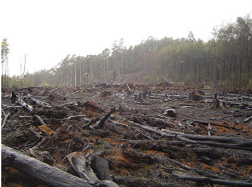
Biochar enthusiasts claim it can improve the quality of the soil and hence improve crop yields and thereby help reduce desertification and deforestation,

reduction in soil carbon. These results from short-term studies —none spanned more than four years — fly in the face of repeated claims that biochar will sequester carbon in soils for tens, hundreds or even thousands of years.